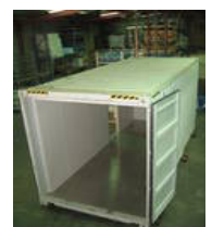
Different angles of the containerised RO unit designed and manufactured by Rowater Australia.